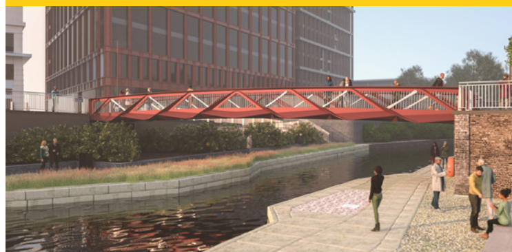
Visualisation of the completed pedestrian bridge linking Pancras Square with Coal Drops Yard

Plans for a new pedestrian bridge linking Pancras Square with Coal Drops Yard, have been approved by Camden Council. It will span the Regent's Canal forming an important connection between the south of the site and the shops and eateries of Coal Drops Yard, enhancing access for residents. Enabling works for the bridge will commence in January 2021 with the bridge lifted into position in April 2021.