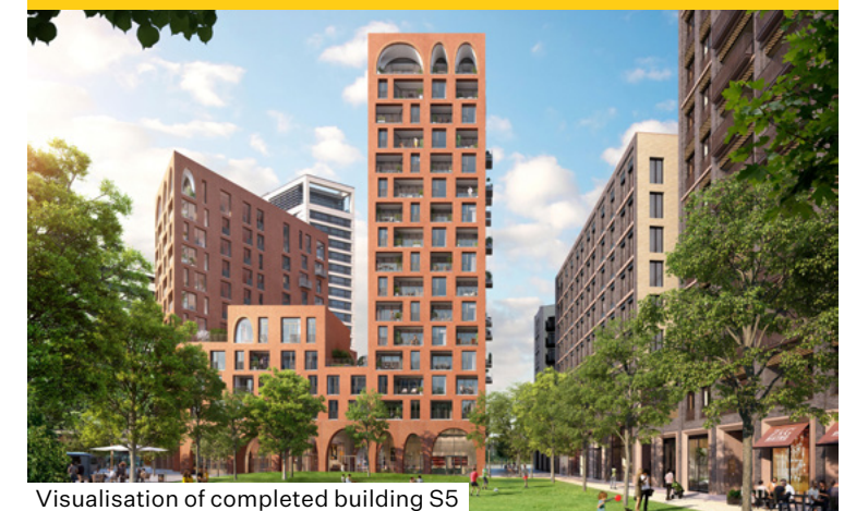
Visualisation of completed building S5

Works at S5, the residential development 'Cadence', have now commenced. The building, which overlooks Lewis Cubitt Park, will feature 158 homes including 60 intermediate affordable rent apartments managed by Pocket Living. It was conceived by Alison Brookes Architects as a six-sided perimeter block arranged around an internal courtyard from which taller forms emerge, ranging from four to fifteen storeys. The works set to be carried out between now and December will primarily be focussed on excavation and piling operations.