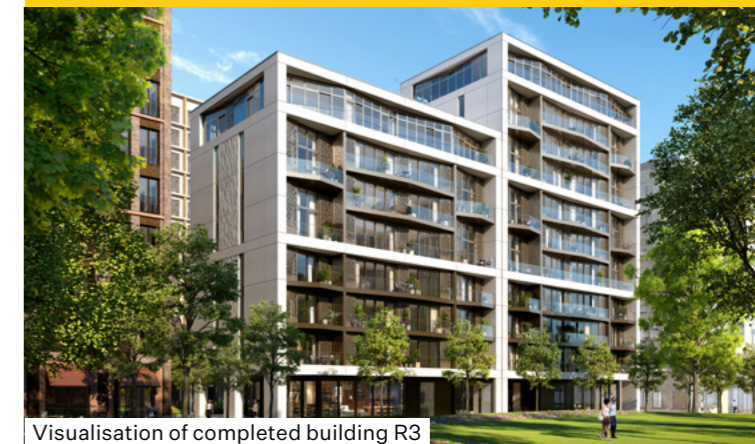
Visualisation of completed building R3

The final internal fittings are now being added to these new homes, ready for the building to complete in mid-August. Extended working hours are taking place currently and will continue until 31 July. From Monday-Saturday and in accordance with the government's temporary extension to site working hours, works will take place from 8am until 9pm for the contractor to install façade panels to the east and west elevation. New residents are expected to move into Luma from September 2020.