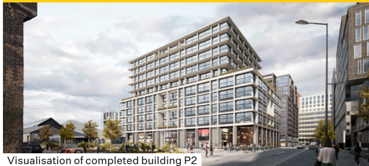
Visualisation of completed building P2

The building, which will be home to a 600 seat theatre, is really starting to take shape. Works are currently focussed on the erection of the structural steel frame, as well as the pre-cast concrete floor. The steel frame is currently at level 7. In line with planning regulations to ensure access to natural light in the building and at ground level, the building steps in at level 7. There will be a terrace garden for the use of the offices, with the main area facing over Lewis Cubbitt Park. Inside the building, the mechanical and electrical fit out for the offices is underway at the lower levels. Once the steel frame is complete and the façade installation has commenced the noise will be more contained within the building. We are looking forward to the building completing this time next year.