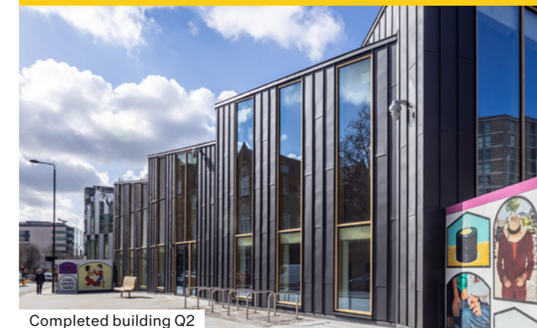
Completed building Q2

This building completed in March. Its eventual permanent use will be as a community sports hall and gym, let by Camden Council and managed by Better Gyms. Initially, however, Q2 will be the temporary home of the Construction Skills Centre. A fitness suite on the upper floor will still be accessible to the public during this time. Read more about Q2 in our spotlight feature.