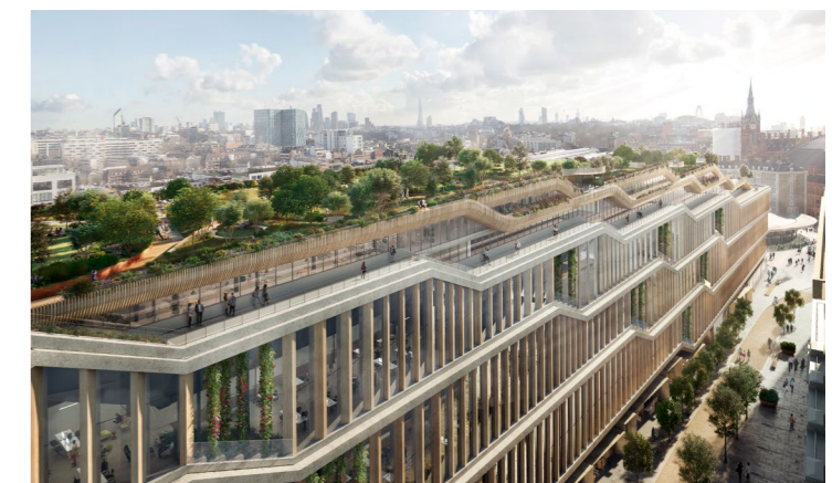
Visualisation of completed A Zone

A brand new art installation is set to be erected at the northern end of Lewis Cubitt Park in March. It will be completed and ready for the public to enjoy by Easter.