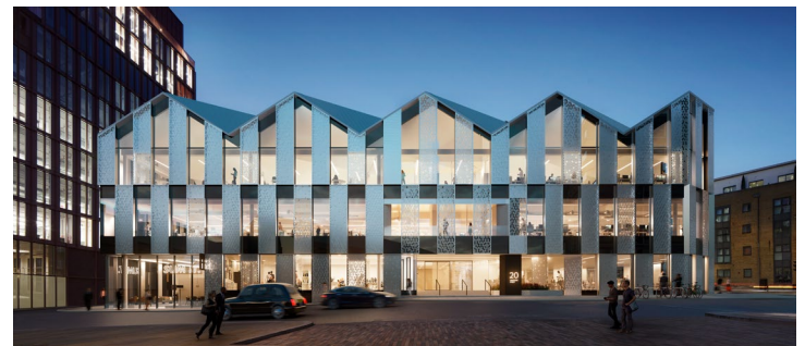
Visualisation of completed building Q1

The hoarding around Q1 has been moved out into Handyside Street while works take place on site, and will be removed in July 2020 when the building completes. Until then, Handyside Street will be entirely one way.