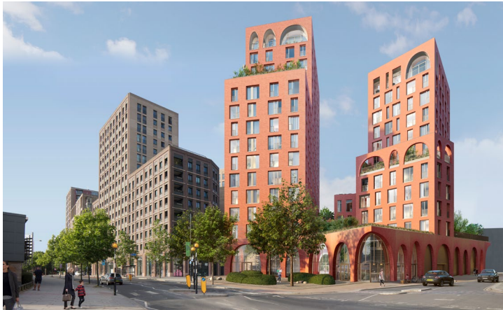
Visualisation of completed building S5

Enabling works at S5 are due to commence in April with construction work beginning in July. S5 is to be a residential building containing 158 apartments and is designed by Alison Brooks Architects, which sits at the northern end of Cubitt Park. The entrances and amenity space will be arranged around an internal landscaped courtyard, and there will be a café on the ground floor. Apartments go on sale in February and details can be found here: https://cadencekingscross.co.uk